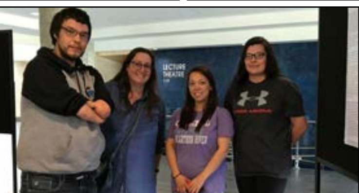
More than 50 people attended SPHERU's Aging Well on the Prairies community connections event at Congress 2018 on May 28. SPHERU faculty took the event as an opportunity to host a conversation about our multi-faceted research program on healthy aging in the province.