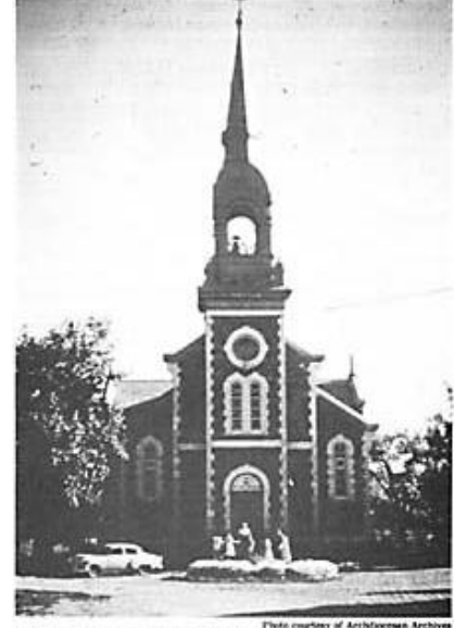
The present fieldstone church in Lebret was built in 1925. This Gothic-style church is a beautiful and imposing landmark.