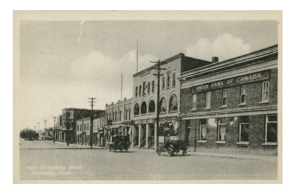
Image credit: Main St looking West, Wolseley Sask. (n.d.). Wolseley, SK: H.O. Langford, Drugs and Stationary.